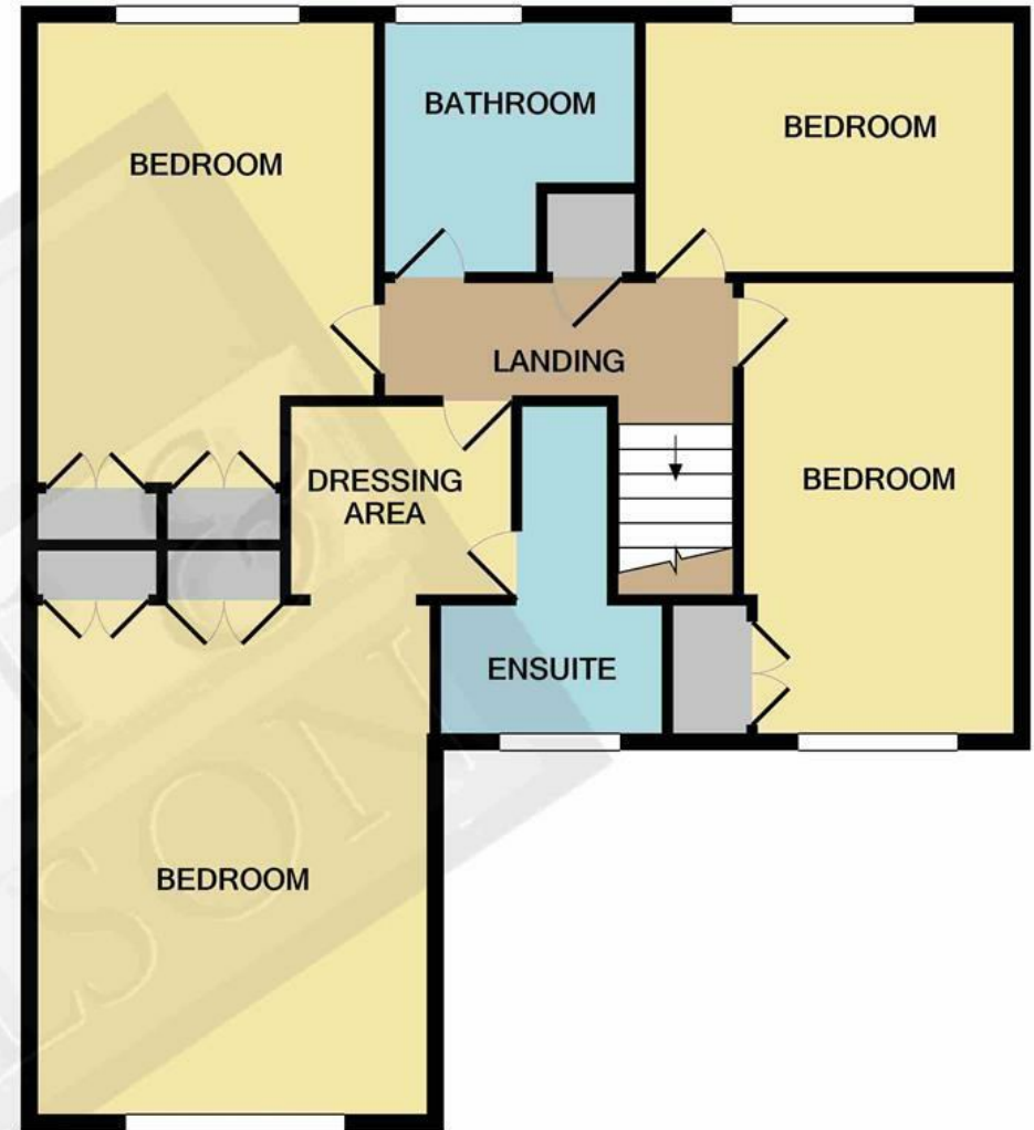
1ST FLOOR APPROX. FLOOR AREA 721 SQ.FT. (67.0 SQ.M.)

TOTAL APPROX. FLOOR AREA 1550 SQ.FT. (144.0 SQ.M.)